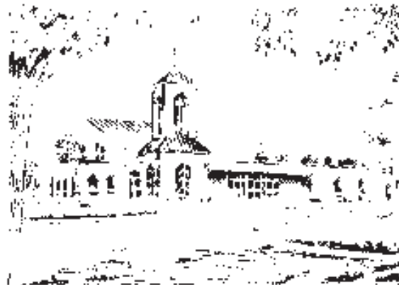
Our Lady of the Lake 129 Metro Road North, Keswick, ON L4P 3C8 Office: 905-476-0097 Fax: 905-476-0897